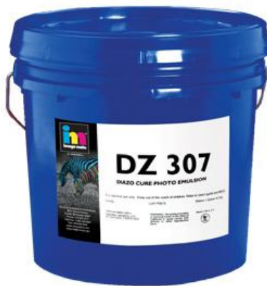
Photo Emulsion Blue DZ 307